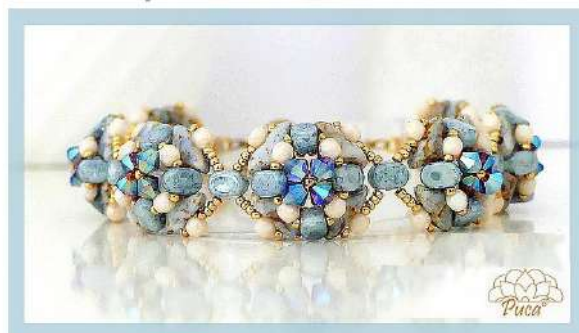
Lipsi® Light Citrus Marble et Helios® White Stony Blue